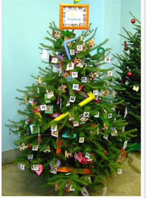
Photo: 2011 Blue Ribbon Winner of Minnesota State Fair (decorated tree category).

Sherry says, "Unfortunately our Minnesota chapter has grown in the last two years to over 700 kids and families. All of them are in picture frames. Keep in mind this donated tree was only 6.5 ft tall but it was still able to hold all the photos".