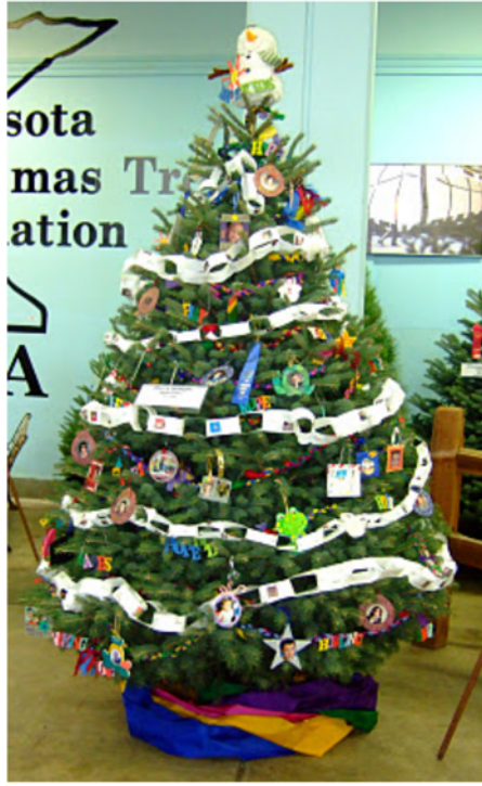
Photo: 2009 Blue Ribbon Winner of Minnesota State Fair (decorated tree category)

It's not hard to see why this tree was chosen for first place. It has a wonderful crafty feel to it and the use of mostly primary colors is a wonderful choice for this subject. Below is an explanation on why it was selected as the winner in the decorated tree category.