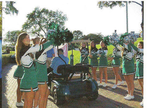
Edina High School cheerleaders